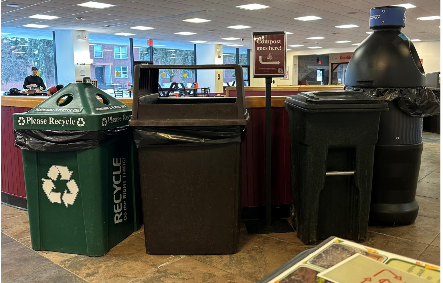
Coordinated with PACES to develop a more efficient arrangement of composting, waste, and recycling bins.