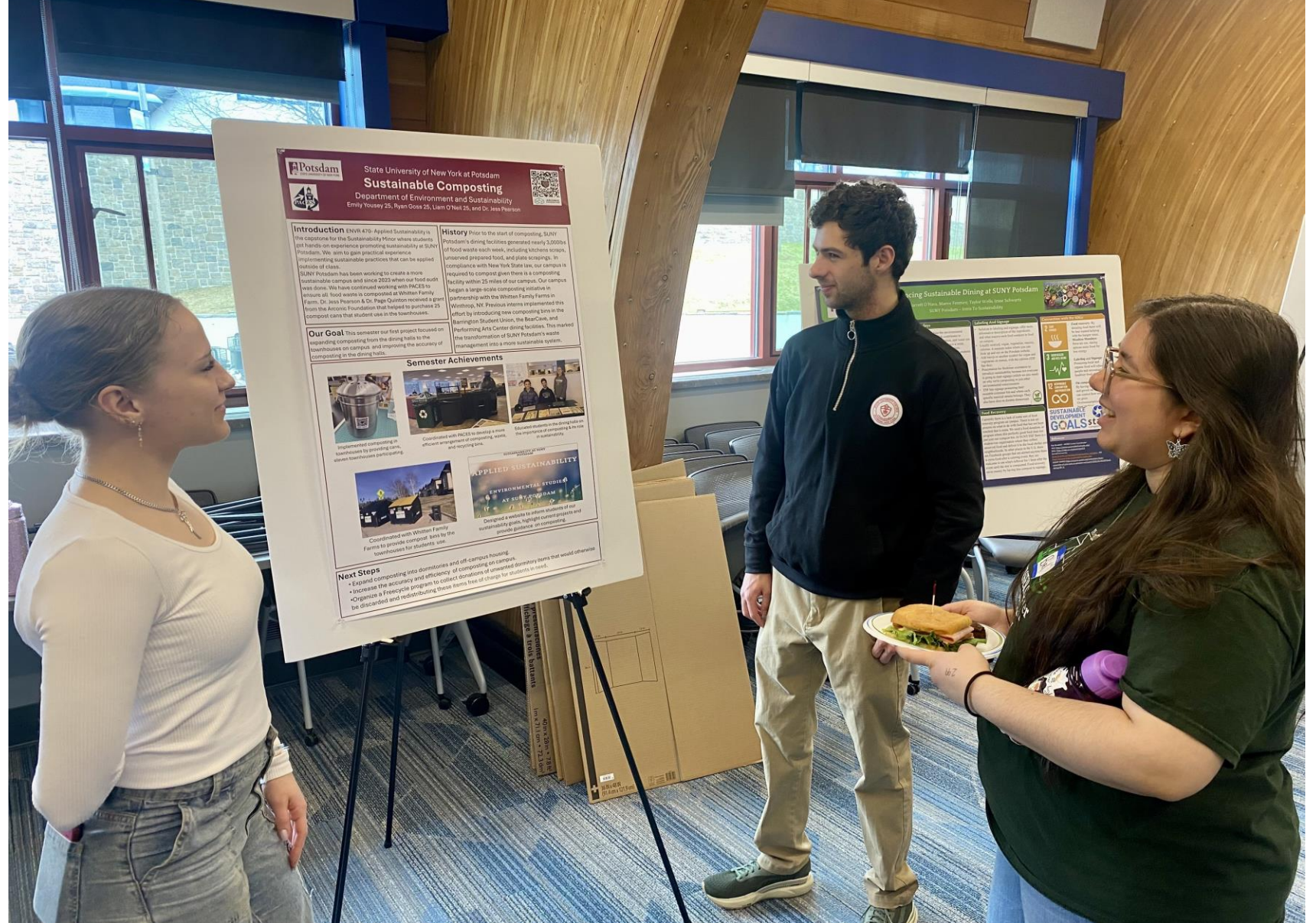
Presented our composting work at SUNY Canton's Sustainability Day Fair.