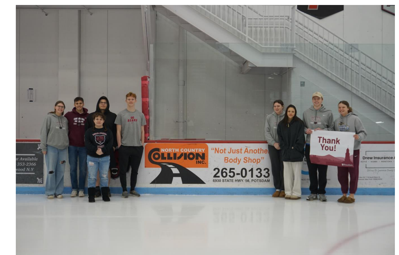
Small Business Saturday Photo with Bears Swim and Diving team

Internships and other applied learning opportunities have shown significant positive impacts on the career outcomes of the students that participate in them. Through my internship I have felt more confident going into interviews and stronger about participating in the workforce.